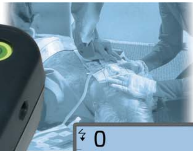
Chest compression depth gauge