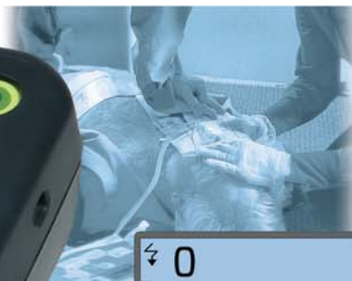
Chest compression depth gauge